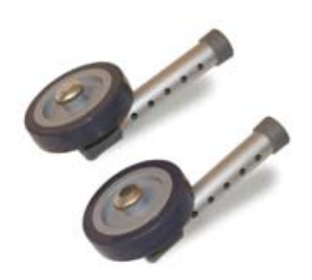
Wheeled Extension Legs