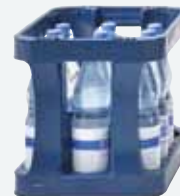
viamobil – small, light, handy and easy to transport