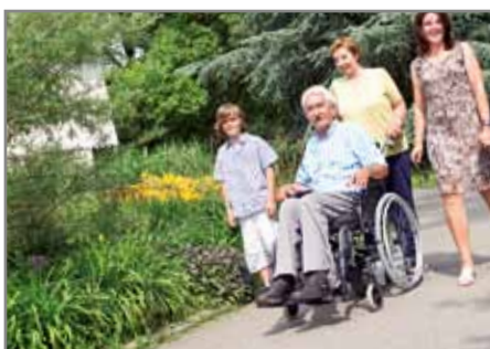
Safety and comfort even on downward slopes.

We ensure mobility. Whatever the situation.