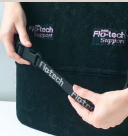
Features and Options