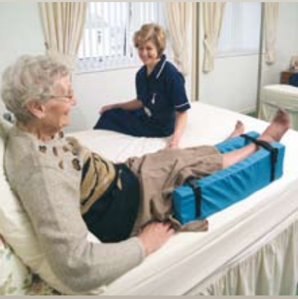
Features and Options