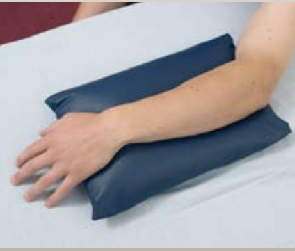
Features and Options

Easy to use and adjust to position, Softform Flexipads , can provide supplementary short-term support for patients experiencing difficulty in maintaining posture.