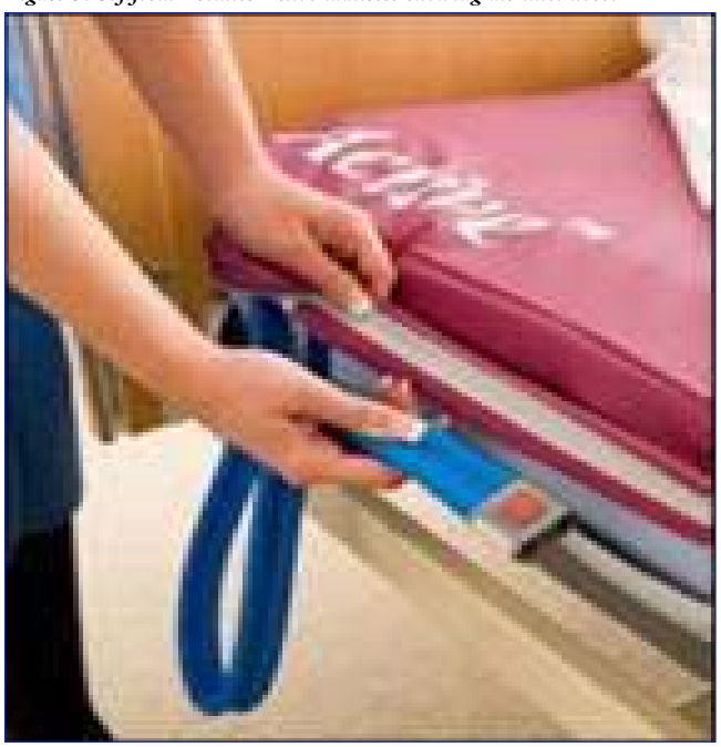
Figure 3. Softform Premier Active mattress showing air inlet hose.

clinical details and to ensure that the patient was likely to remain in bed for at least 5 days. This assessment was to reduce confusion in interpretation of results on product performance, because if the Softform Premier Active was used for patients sitting out of bed, it would be difficult or impossible to distinguish any new tissue damage acquired by patients as a result of lying on the mattress (Gebhardt, 2004).