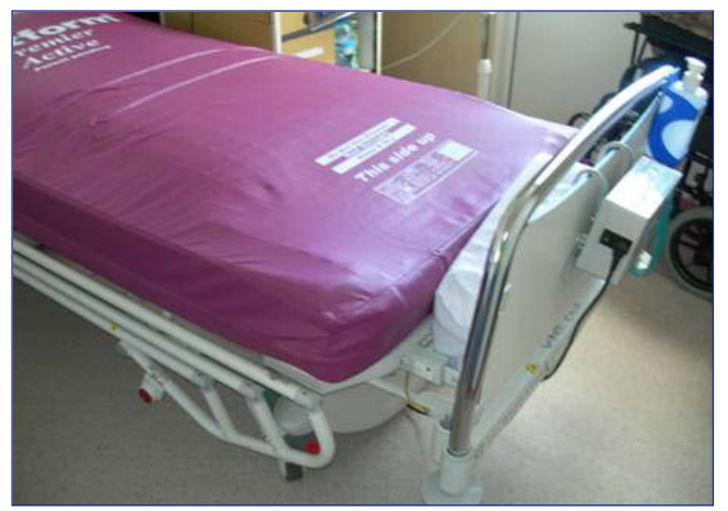
Figure 2. Softform Premier Active mattress complete and inflated.

If Softform Premier Active mattresses remained in stock, the author spoke with the ward staff by phone to verify