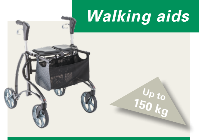
Invacare<sup>®</sup> Dolomite Jazz