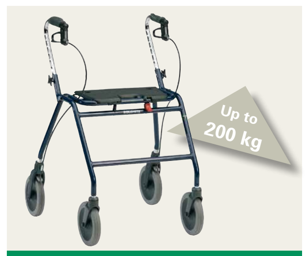
Invacare Dolomite Maxi Plus

The Invacare® Dolomite Soprano is a light outdoor walker with large wheels, providing excellent skills on rough uneven ground. Easy to deal with as it can be folded and stands in the folded position. Invacare Dolomite Soprano has bariatric functions in a lightweight suit. It is designed for users with a bodyweight of up to 160 kg.