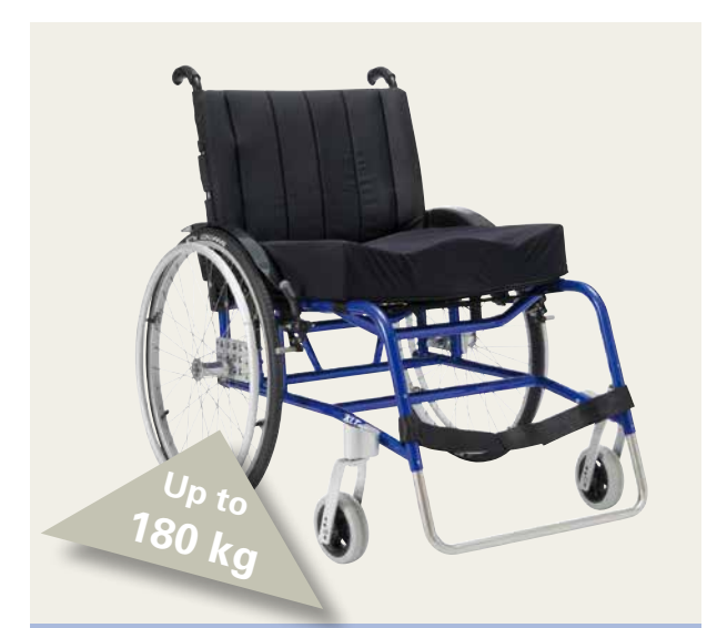
Invacare XLT Max