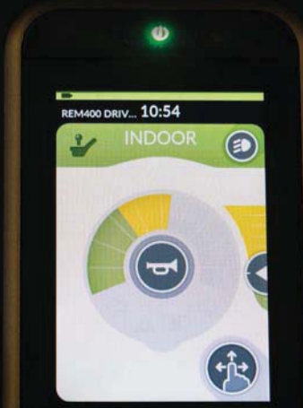
Swipe operation – Right hand use