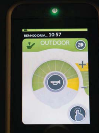
Tap operation – Right hand use