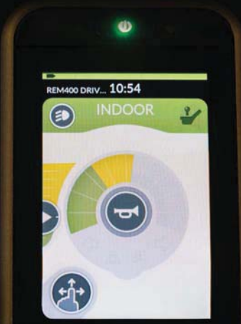
Swipe operation – Left hand use