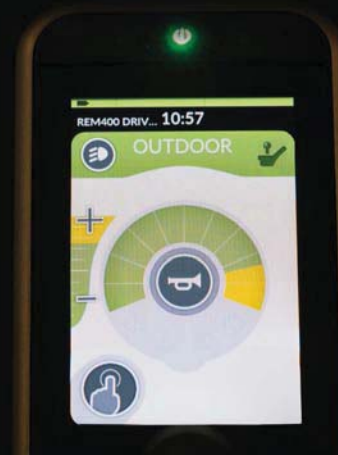
Tap operation – Left hand use