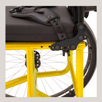
Adjustable COG option.