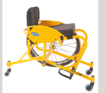
Sleek curved frame members add a sharp look, for more rigidity and durability.

Fixed swivel anti-tip, height adjustable.