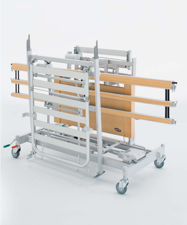
Bed parts, mattress and accessories are stored directly on the base with special hooks; storage and transport are facilitated and the bed takes up less space.