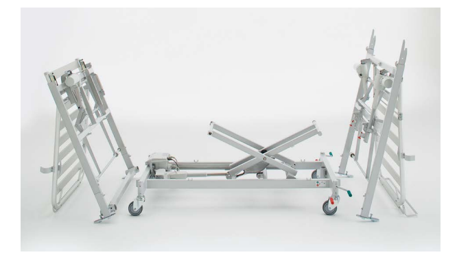
Activate the quick release and the scissor is detached. The handle makes it very easy to dismount.