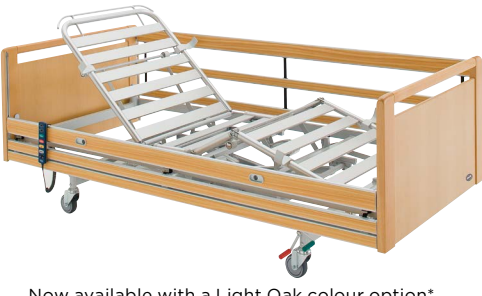
Now available with a Light Oak colour option*