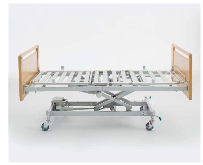
Bed ends can be dismounted without tools.