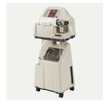
Combine with Platinum ® 9 for high flow patients