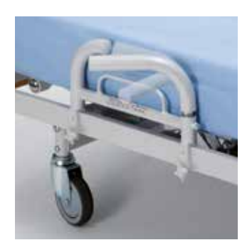
Turnable Support Handle

The extra low height levels are an integral benefit of the Etude Plus Low , increasing safety and reducing the risk of harm for people who are prone to falling out of bed. The low level also makes it easier for patients to transfer in and out of bed.