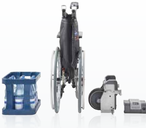
viamobil – small, light, handy and easy to transport

Transporting viamobil is easy and convenient, even in fairly small cars. The individual modules are light and sturdy and have useful carrying handles for quick stowage. No tools or prior manual skills are required to remove viamobil, stow it away in a small space along with the wheelchair and then get it ready for operation again in a few easy steps. This allows you to be mobile simpler and faster.