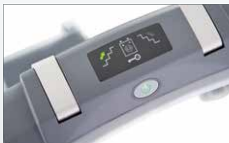
Display showing all functions at a glance