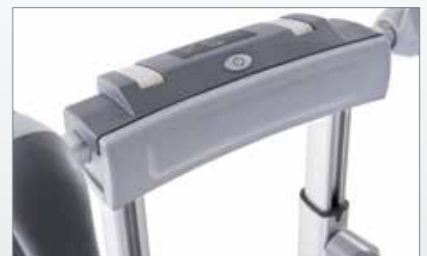
Comfortable cushioning for resting the operating unit on the thigh while climbing the stairs