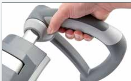
ErgoBalance grips: non-slip with a convenient shape

With excellent ergonomics, all operating elements are in exactly the right place and the stair climber stays in an optimal position in the hands. This is where Alber's more than 25 years of experience in the development of mobile stair climbers can really be felt and experienced.