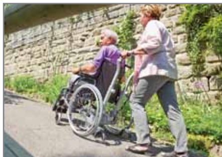
Mastering uphill inclines without any difficulty.