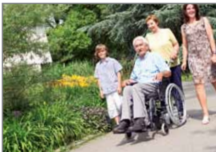
Safety and comfort even on downward slopes.

We ensure mobility. Whatever the situation.