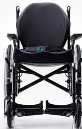
Action 3 NG