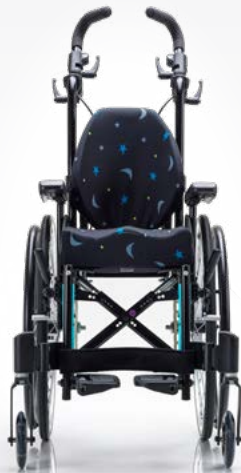
Action 3 Junior