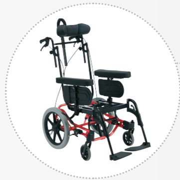
◀ Rea Azalea Base

Designed for clients seeking a custom-made seat combined with a first-class wheelchair base, the Rea Azalea Base is adapted from our standard Rea Azalea model and boasts all the advantages of this sturdy, tilting chair, such as the unique weight-shifting mechanism. A key feature of the Base is the 'Tilt in Space' function a weight shifting mechanism that ensures stability for the client when tilted.