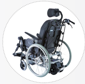
◀ Rea Azalea & Alber viaplus V12

Unlike many other pushing aids, the viaplus V12 does not impede the adjustability of tilt in space wheelchairs (with a seat height of 450 mm). All of the wheelchair functions remain accessible. That is why the viaplus V12 can remain on the wheelchair after a walk without restricting the use of its' functions.