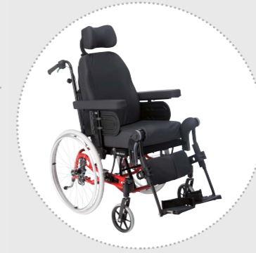
◀ Rea Azalea Tall

Rea Azalea Tall is specially designed to meet the needs of tall clients who require a Tilt in Space wheelchair with more extended seat support. Adapted from the Rea Azalea , the Rea Azalea Tall boasts all the advantages of a reliable, tilting wheelchair and offers a unique weight shifting mechanism.