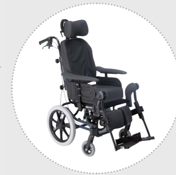
◀ Rea Azalea Minor

The Rea Azalea Minor is designed for clients that require a smaller depth and width seat. Adapted from the Rea Azalea , the Azalea Minor boasts all the advantages of a reliable, tilting wheelchair with its unique weight-shifting mechanism. Available in 5 frame colours and with a fixed or tension adjustable backrest.