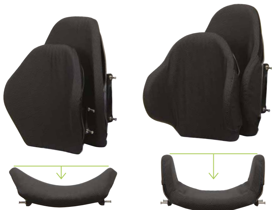
▲ E2 Back E2 Standard - 8cm Contour