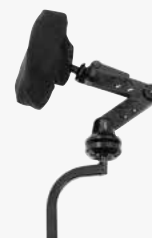
Invacare Matrix® Elan Headrest