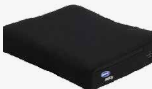
Invacare Matrix® Libra cushion