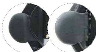
Inside Mount Outside Mount