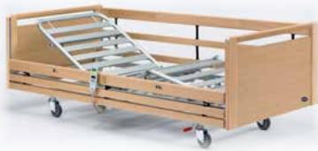
► Invacare® SB 755