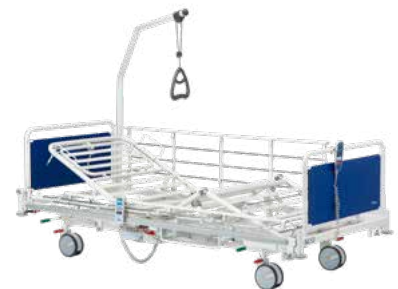
► Invacare® SB 910