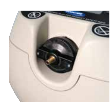
New patient-outlet HEPA filter

The easy-roll cart with large wheels and adjustable handle means the SOLO <sub>2</sub> is never far behind.