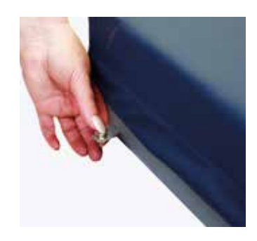
Detach the pipes from the foot end of the mattress.