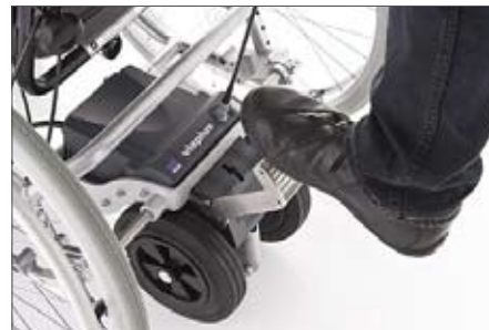
Disengaging the drive unit

The handy controls of the viaplus fit onto the handle of the wheelchair without impeding the use of the wheelchair's functions. The wheelchair is propelled forwards by light thumb pressure on the operating lever, making fatigue-free operation possible even on longer journeys. The chair is put into reverse by pulling the operating lever upwards. And for indoor manoeuvring without the aid of the viaplus, the drive wheels can simply be raised by pushing down on the pedal.