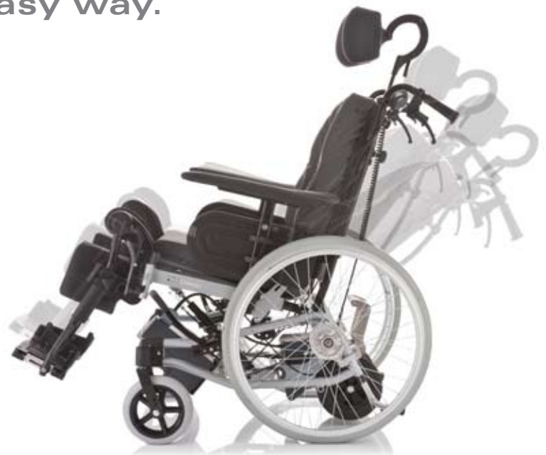
viaplus with differing backrest inclinations

viaplus is also used in residential homes. With it, pushing the wheelchairs becomes an effortless task and lightens the load for the staff.