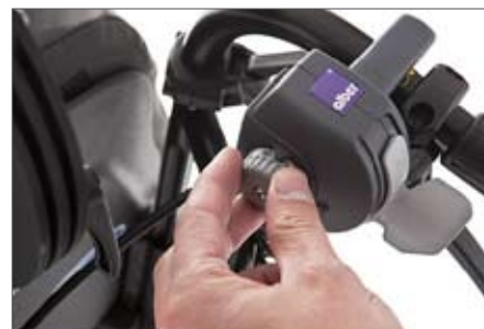
On/Off and speed adjustment

The wheelchair's functions are all clearly marked on a handy, non-slip grip control knob that can be operated with just one hand – for easiest possible use from the word go. The rechargeable battery of the viaplus is mounted inconspicuously below the seat of the wheelchair and is powerful enough for even long walks. It can be quickly and easily recharged using the battery charger supplied with it.