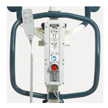
Control box with diagnostic system

The foot plate is horizontal and can be removed for standing/walking a patient during rehabilitation.