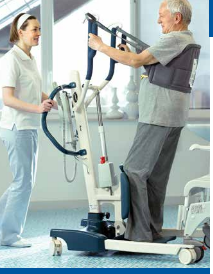
Features and Options