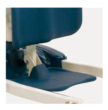
Removable foot plate

The padded leg support can be adjusted for different needs.