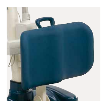
Height-adjustable leg support

The Roze is fitted with a control box that has a diagnostic system: an intelligent service lifetime monitoring system that highlights the battery status and service condition of the actuator to ensure safe patient handling.