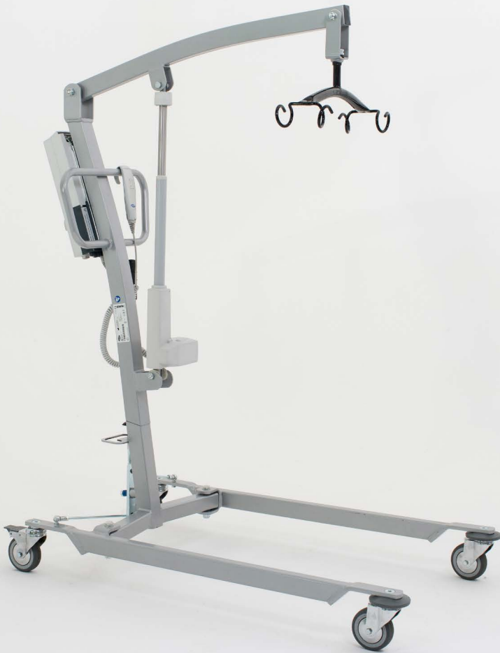
Invacare Atlante - electrical version