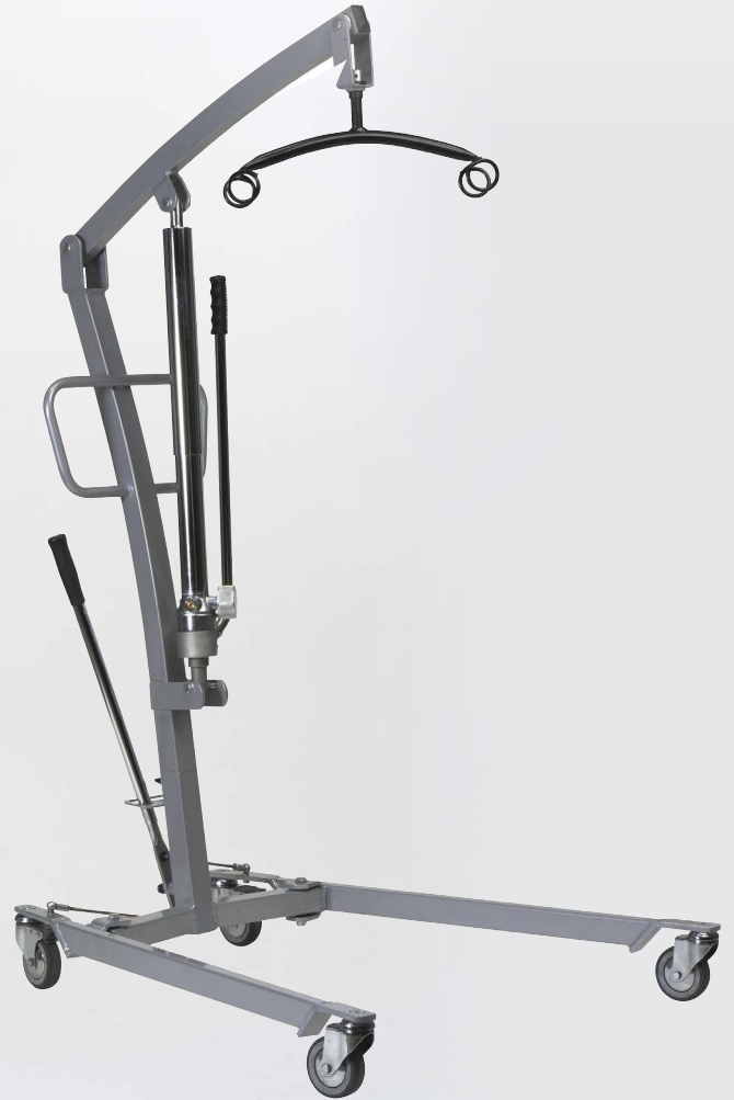
Invacare Atlante - manual version

Compact and easy to maneuver - the best choice for homecare