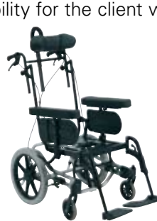
Rea Azalea Base

Unlike many other pushing aids, the viaplus V12 does not impede the adjustability of a tilt in space wheelchair (with a seat height of 45 cm). All of the wheelchair's functions remain accessible. That's why the viaplus V12 can simply be left on the wheelchair after a walk without restricting the use of its functions.