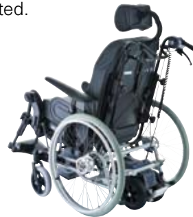
Rea Azalea & Alber viaplus V12

Ideal for those in need of a stable, secure chair, with custom-made comfort. The Base can be used together with all parts and accessories of other Rea Azalea models (except trunk support).