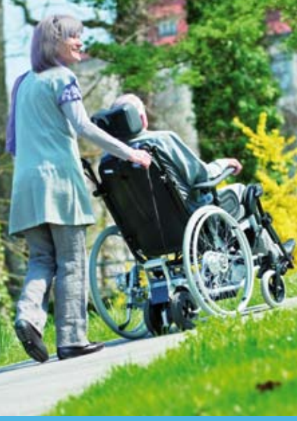
Features and options